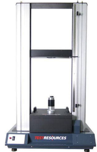
312 family with torsion

Contact an application engineer to configure a solution to your application requirements.